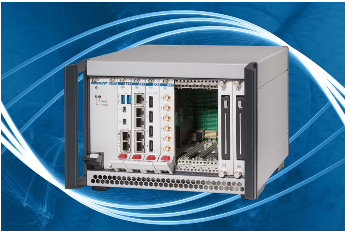
SRS-4401-SERIAL • Sample System Configuration