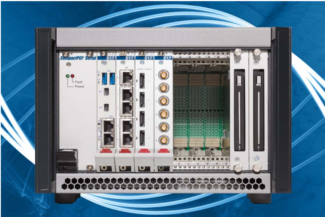
SRS-4401-SERIAL • Sample System Configuration