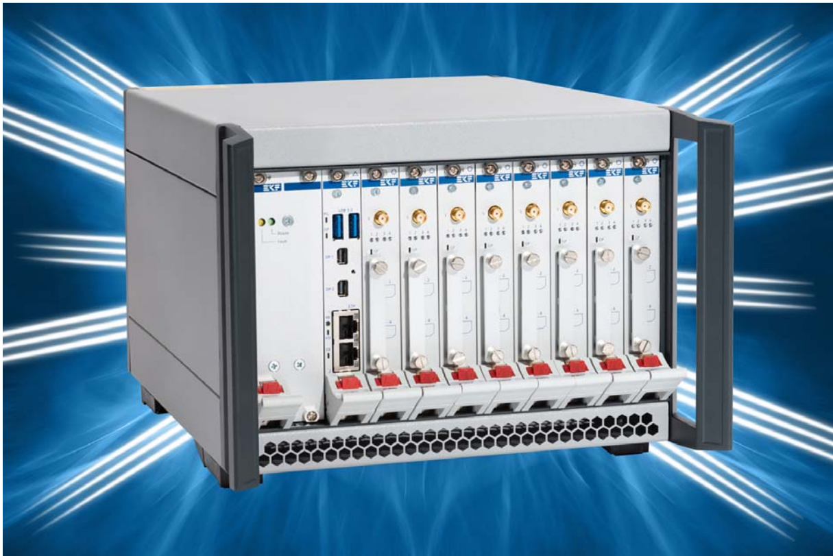
Sample Custom Configuration