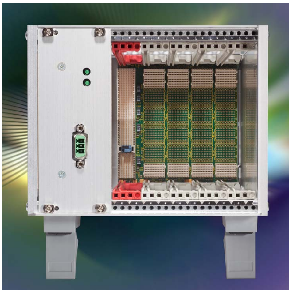
Small Size Hybrid Backplane Systems