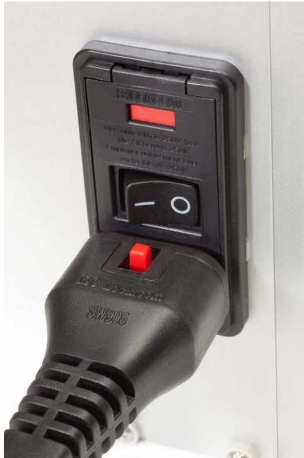
Option AC Plug Locking Mechanism