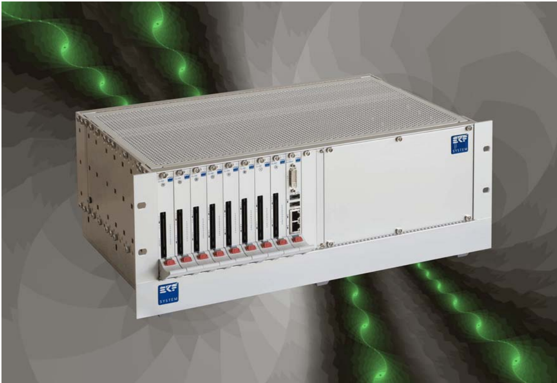
Custom Specific CR4-RACK

Typically, the CR4 series of racks will be configured individually according to the customers needs (see examples below). We can tailor any CompactPCI® system to your special needs - turnkey ready! Please contact sales@ekf.com for an offer.