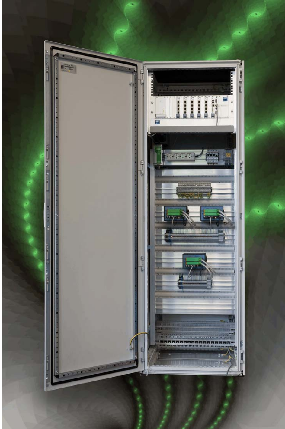
Cabinet w. CR4-RACK