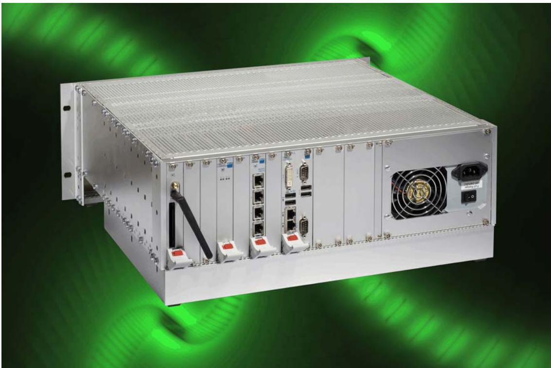
CR4-RACK w. Economy Power Supply