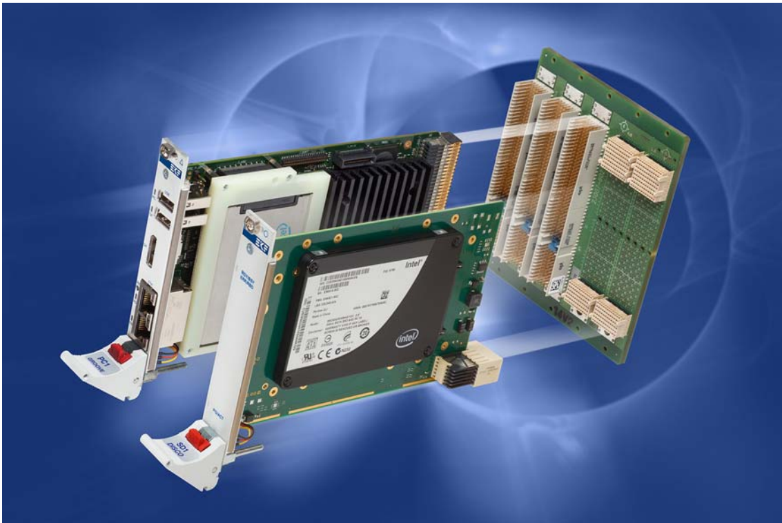
Hybrid Backplane CompactPCI® & CompactPCI® Serial for 3U Systems