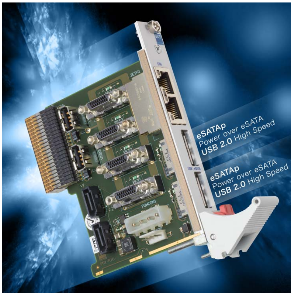
CompactPCI® PlusIO Rear I/O Module Option