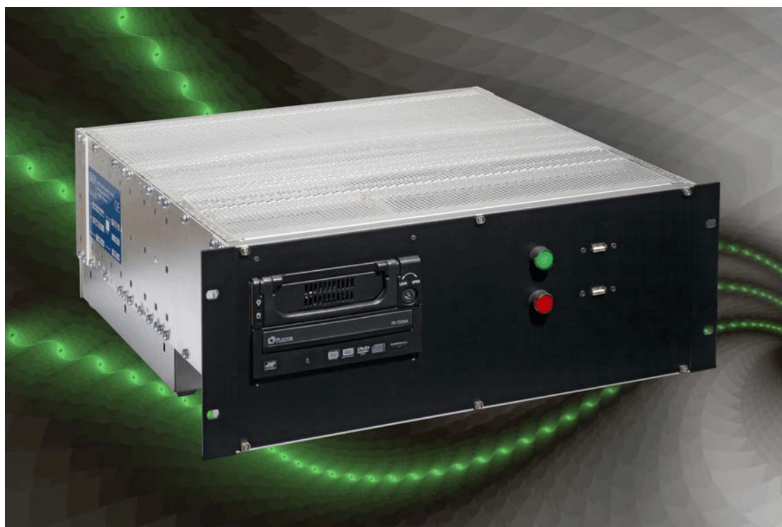
Closed Front Panel CR4-RACK