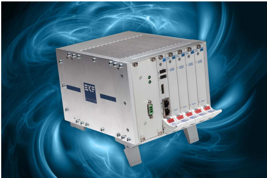
Small Size 3U/4U Systems