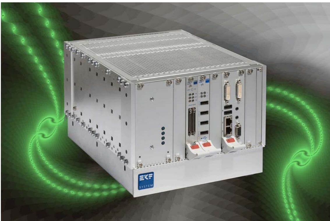
Half-Size 19-Inch CR4-RACK