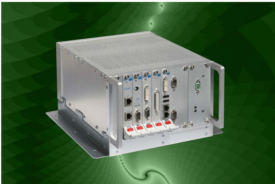
Wall Plate CR4-RACK