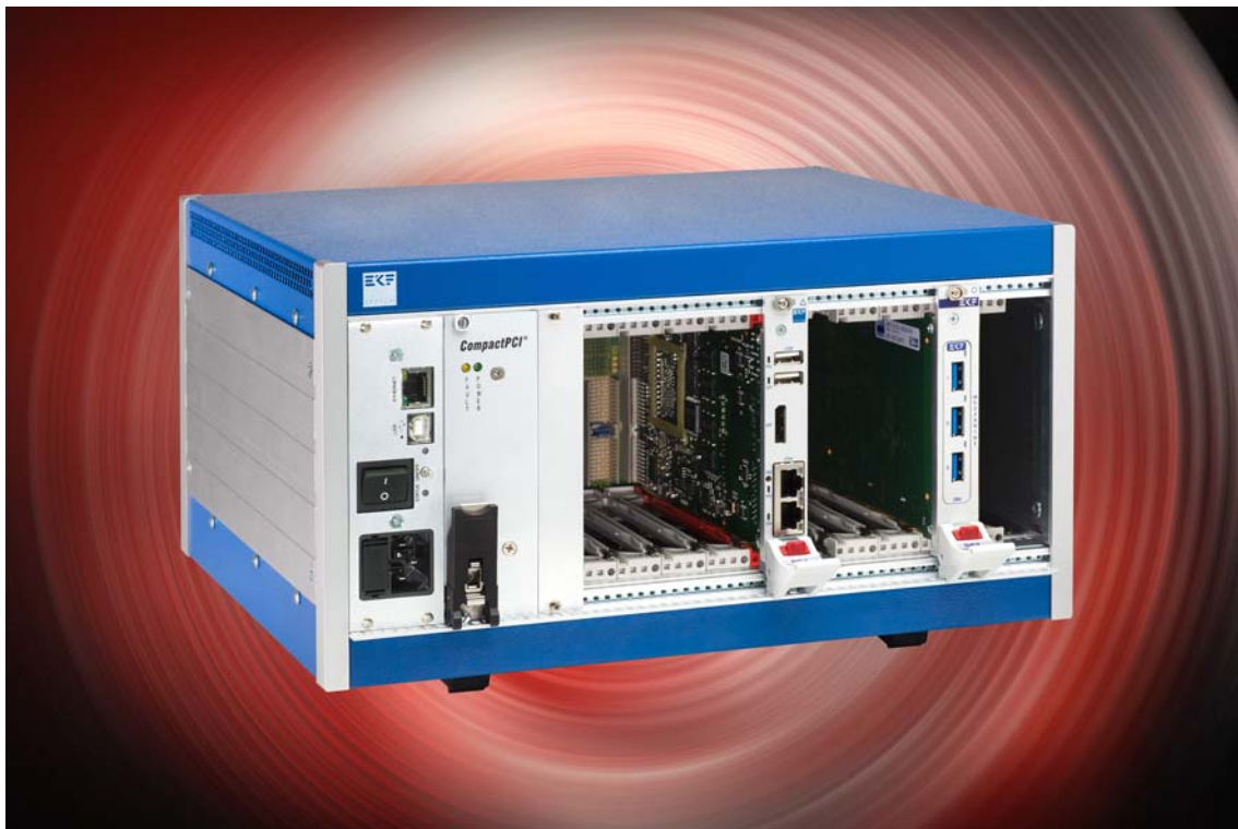
Hybrid Systems CompactPCI® & CompactPCI® Serial