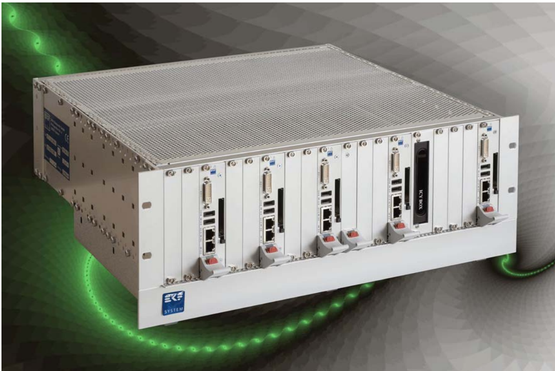
Multiple CPU CR4-RACK