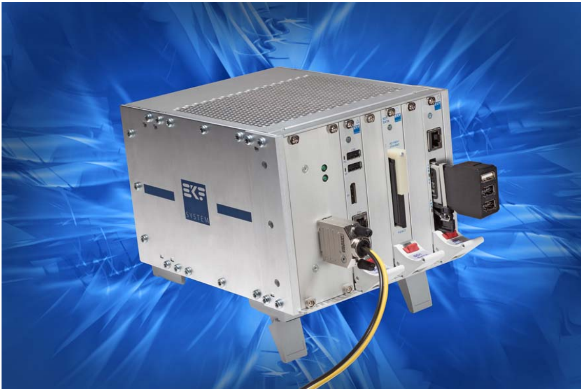
Small Size Custom 3U/4U Systems