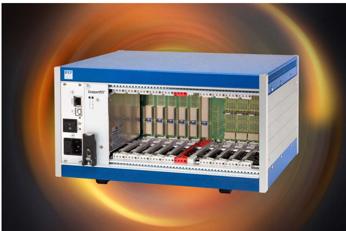
Hybrid Systems CompactPCI® & CompactPCI® Serial