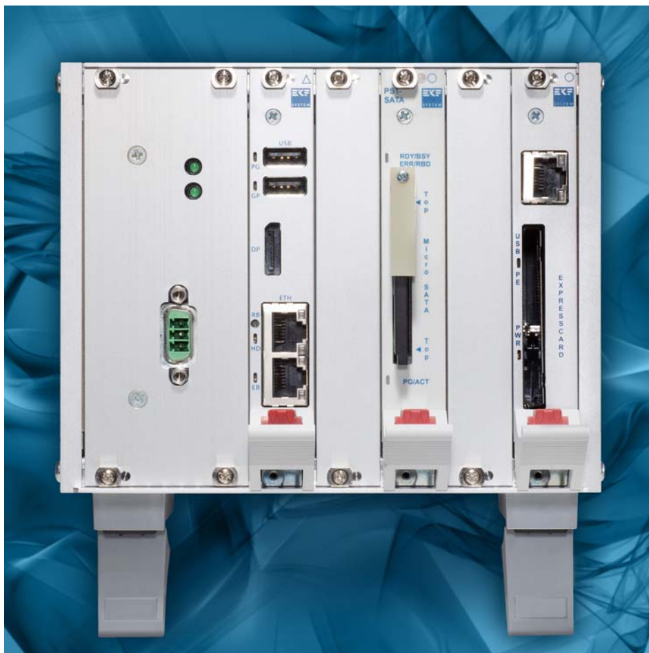
Small Size Custom 3U/4U Systems