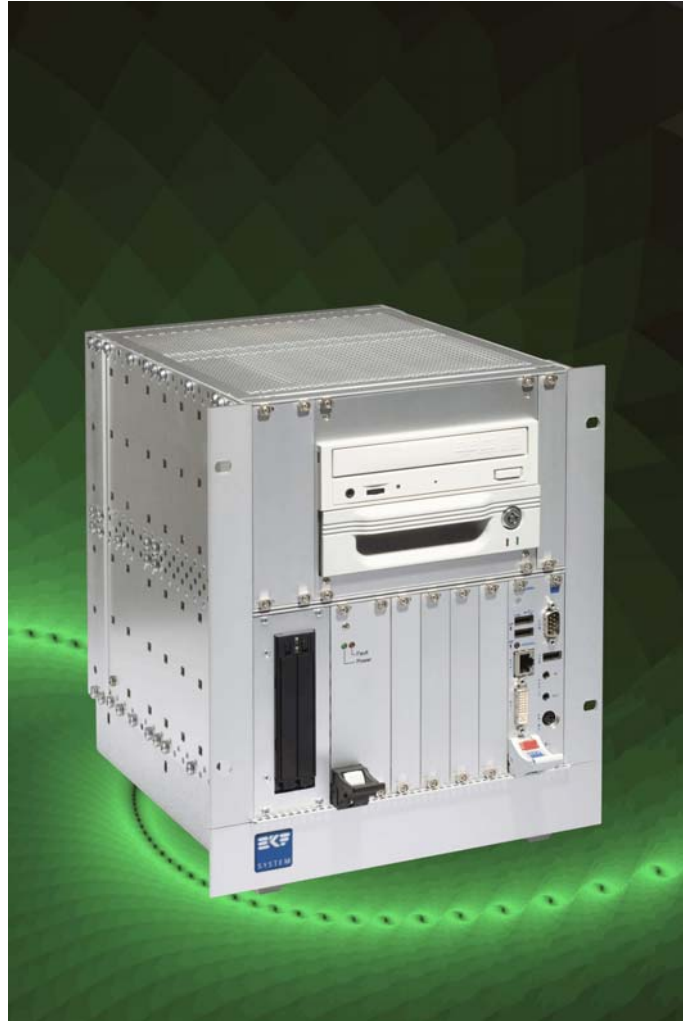
Drives Stacked on Top of CR4-RACK